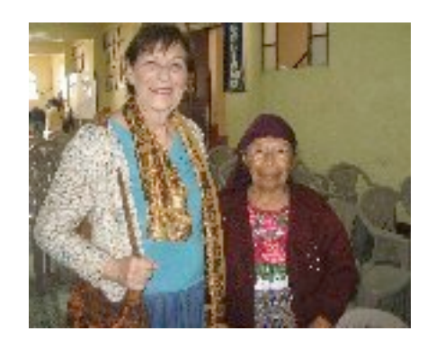
DEAR 96-YEAR-OLD KAQCHIQUEL MOTHER OF PASTOR