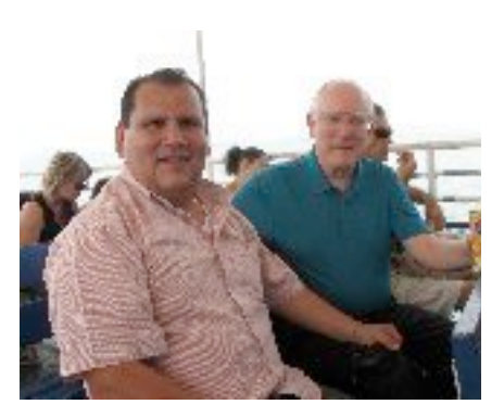
WITH RIGO ON COSTA RICAN FERRY