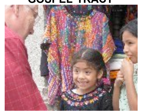
ALWAYS BLESSED BY SMILES OF GUATEMALAN CHILDREN