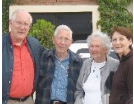
VERY DEAR FRIENDS WHO HAVE BEEN MISSIONARIES FOR 50 YEARS